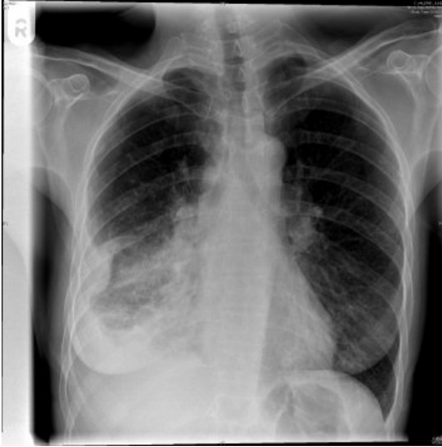
Right pleural metastases and pleural effusion due to carcinoma of the ovary