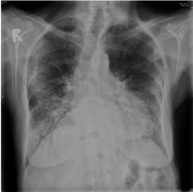
Pulmonary fibrosis and superimposed infection