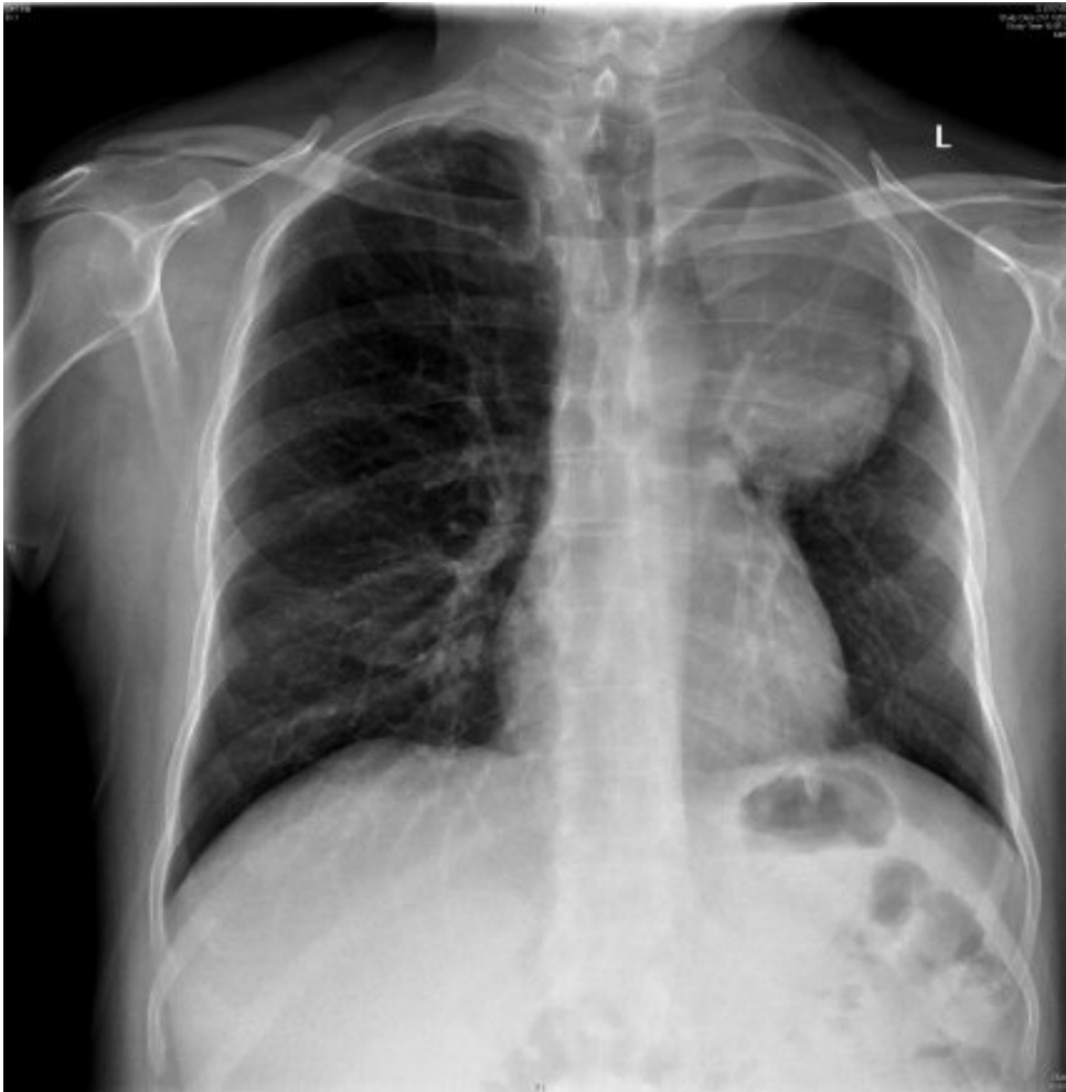
Left upper lobe tumour