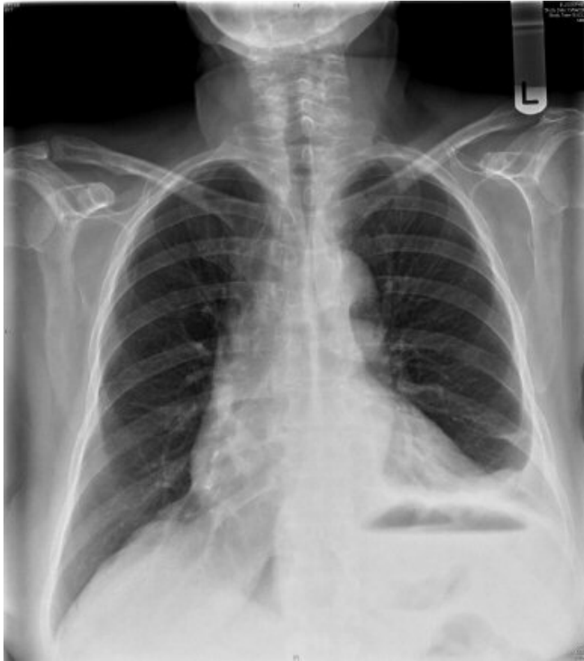
Left basal pleural effusion and consolidation