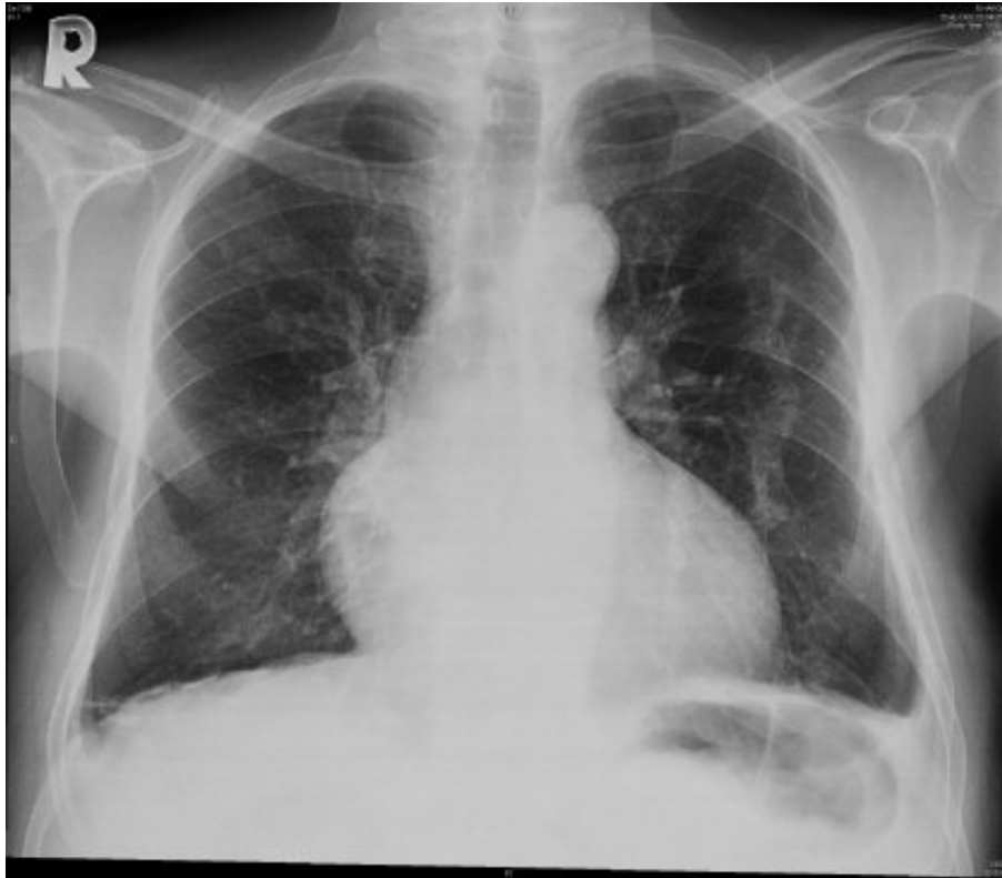
Pleural calcifications and adhesions due to asbestos exposure